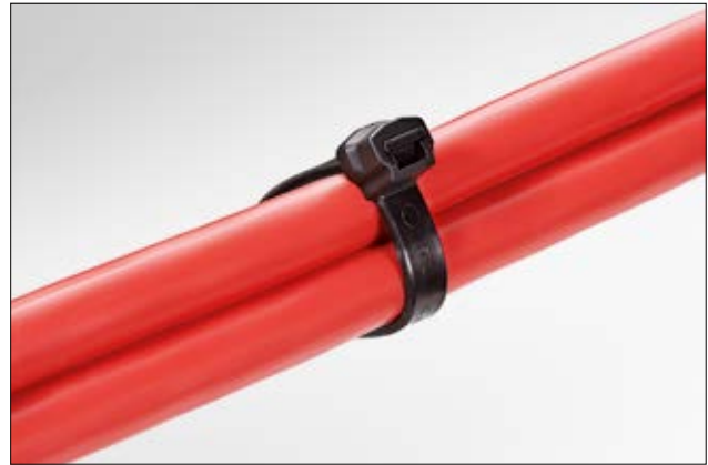
The new Z-Series head design offers a high resistant against mechanical forces.